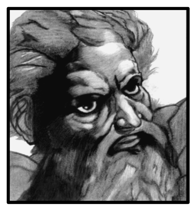
CHAPTER 1 THE HOLY VIRUS

THE FUNDAMENTAL RULE IN THE ENGAGEMENT OF RATIONAL THOUGHT IS THAT IF YOUR BASIC PREMISE IS WRONG, THEN ALL SPECIFICS THAT FOLLOW IN YOUR CHAIN OF REASONING ARE ALSO FLAWED. IN FACT, THEY ARE WORTHLESS. TO BUILD A CASE WITH AN ARRAY OF SEEMINGLY PERSUASIVE POINTS IS MEANINGLESS IF ONE'S STARTING POINT IS FLAWED.